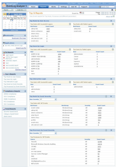
Event-based reports show you at one glance, which hosts have generated maximum important events